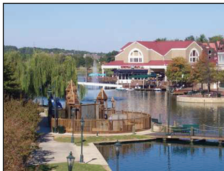
Hilton Charlotte University Place Lakefront